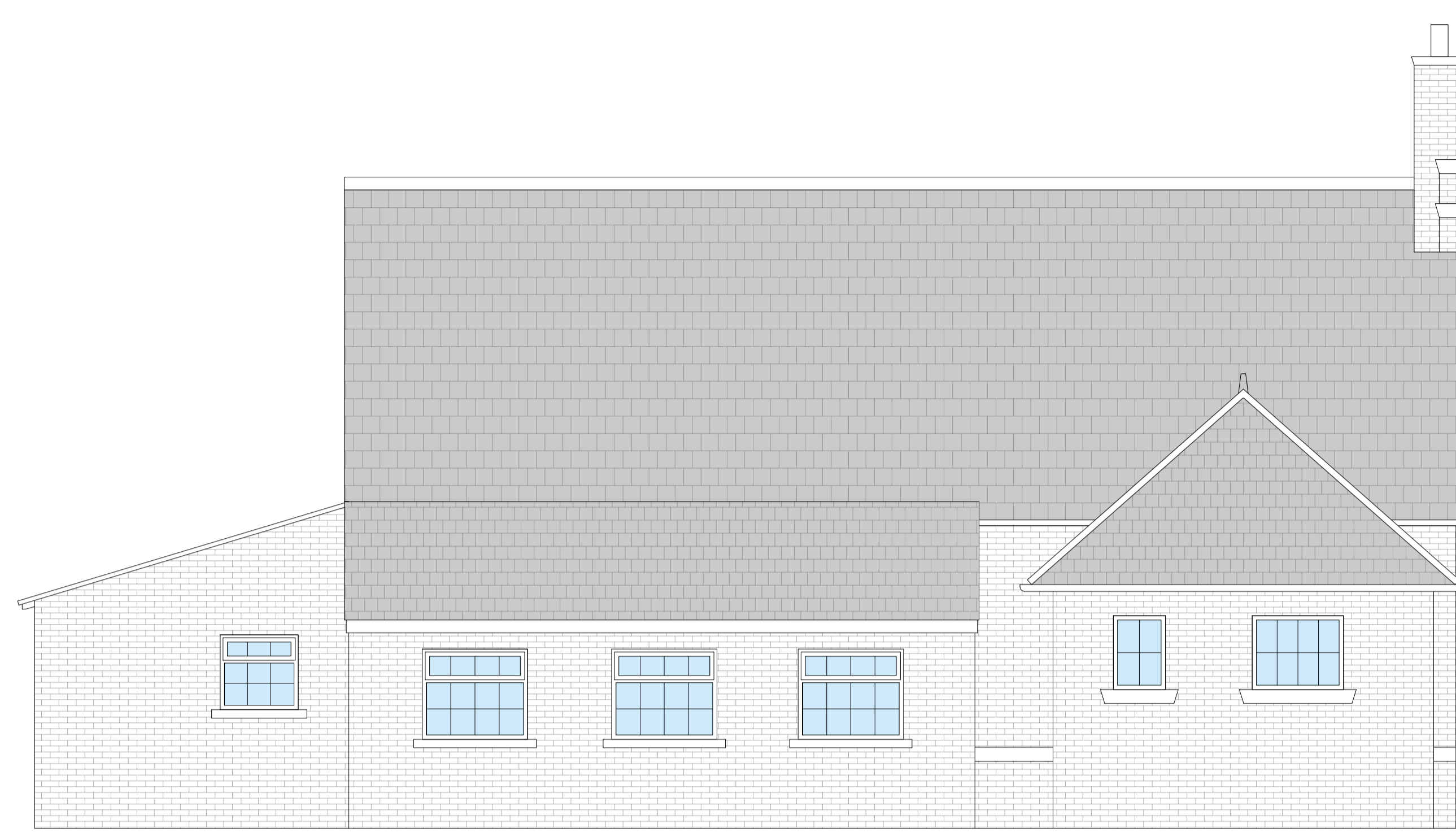
EXISTING WEST ELEVATION SCALE 1:50