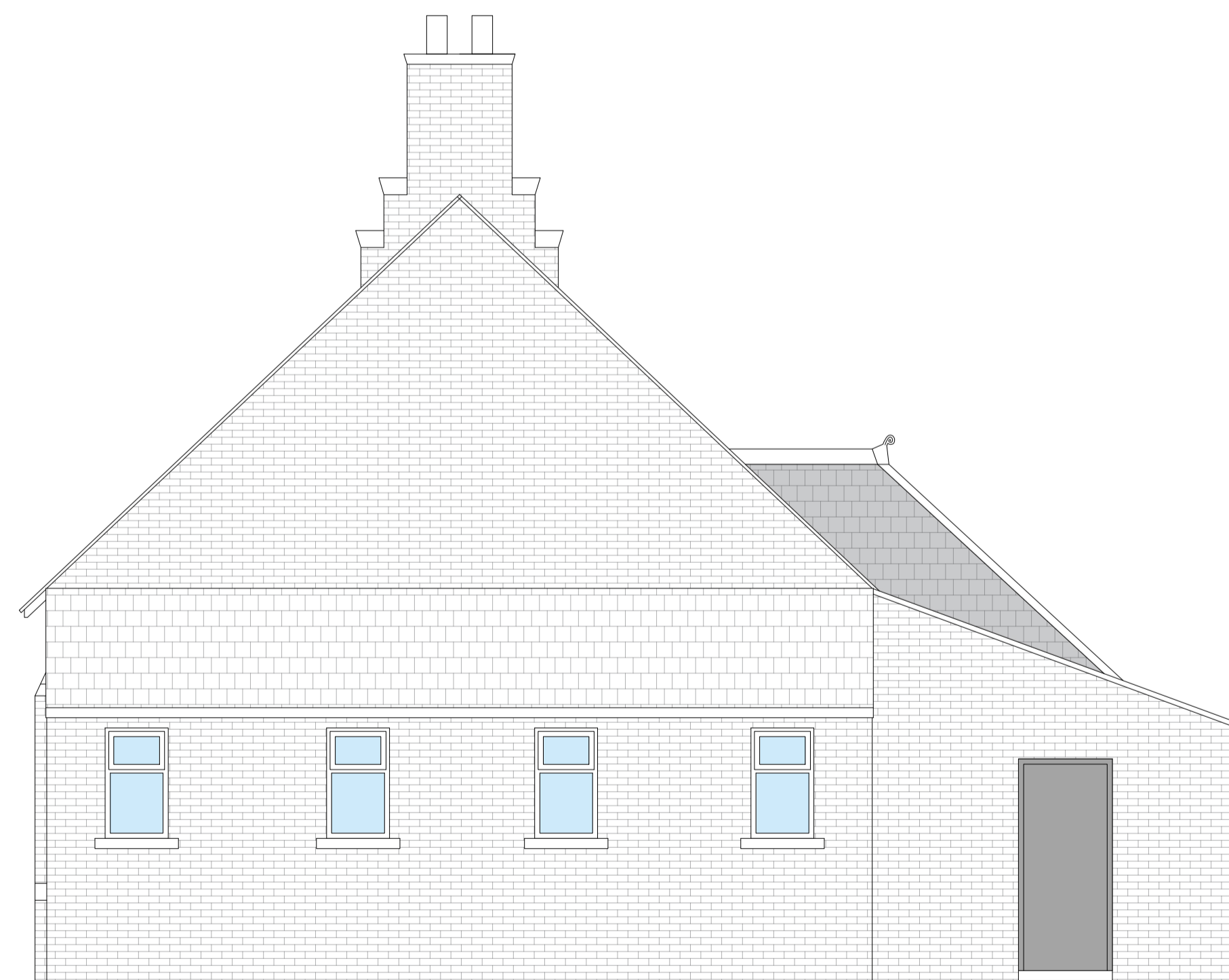
EXISTING NORTH ELEVATION SCALE 1:50